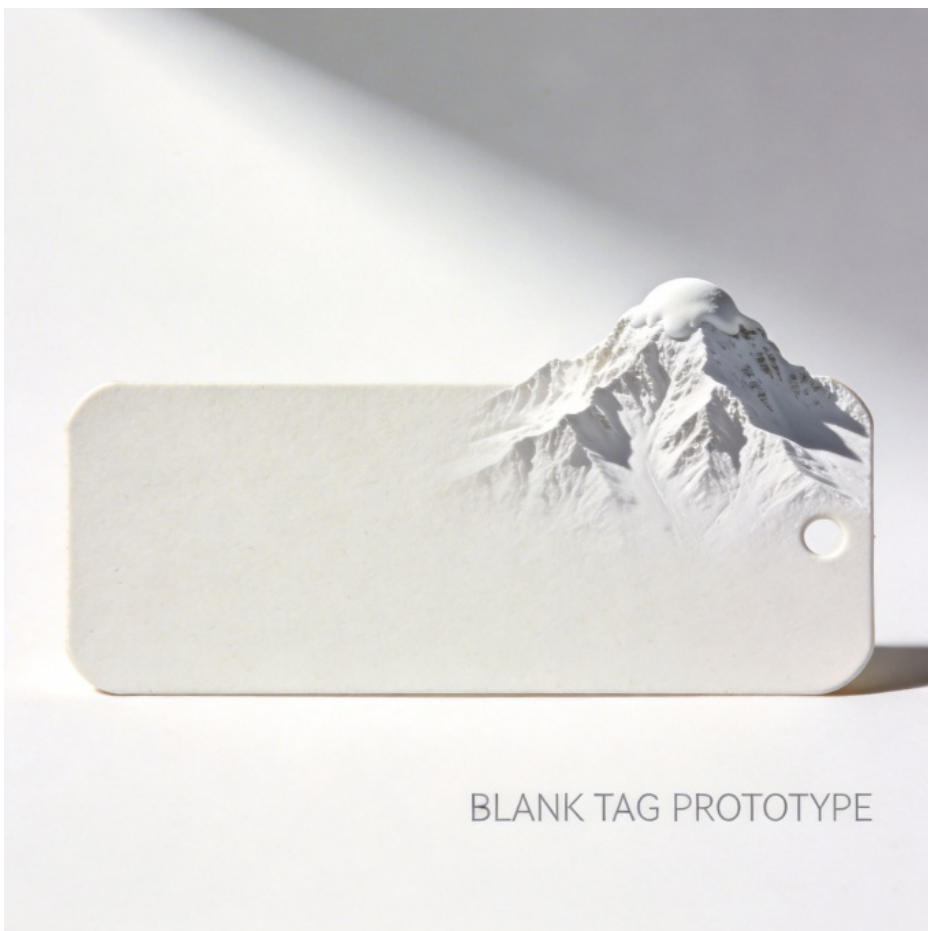
BLANK TAG PROTOTYPE