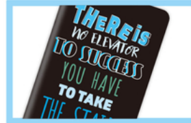
Motivational notes with quotes