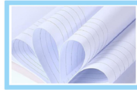
Quality lining paper 32 pages /16 sheets