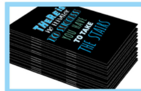
Strong and delicate